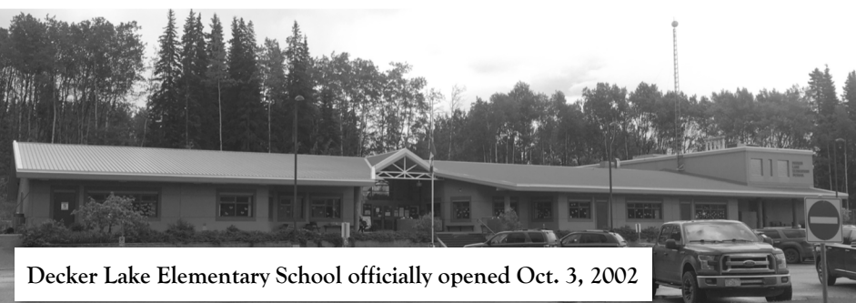
Decker Lake Elementary School officially opened Oct. 3, 2002