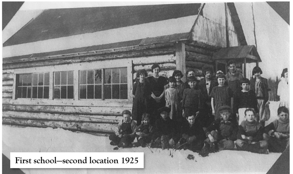
First school—second location 1925

to the newly built main road, known today as Highway 16. In its new location, this building served the community until the 1930s. Here is the original log schoolhouse in it's new location: